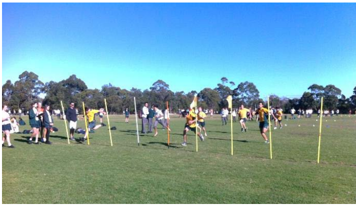
The Boys' Final with Matin Abroon claiming victory