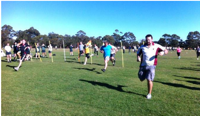
The teachers' race