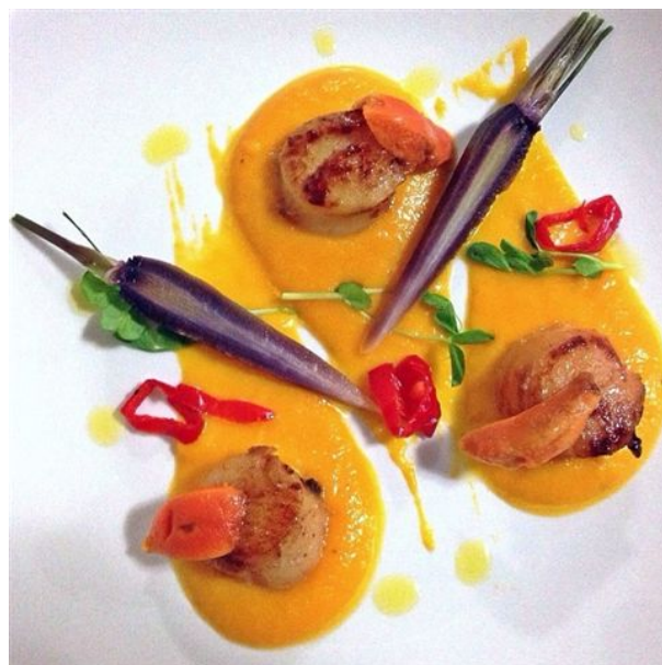
Seared scallops on carrot purée with pickled Anaheim peppers, purple carrots and snow pea sprouts