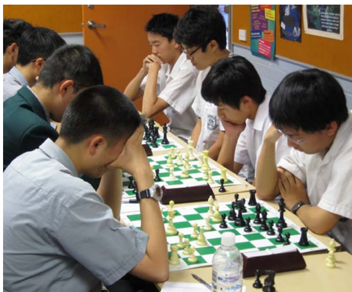
The Intermediate team in action against James Ruse

Thanks to all the players and the parents who drove them.