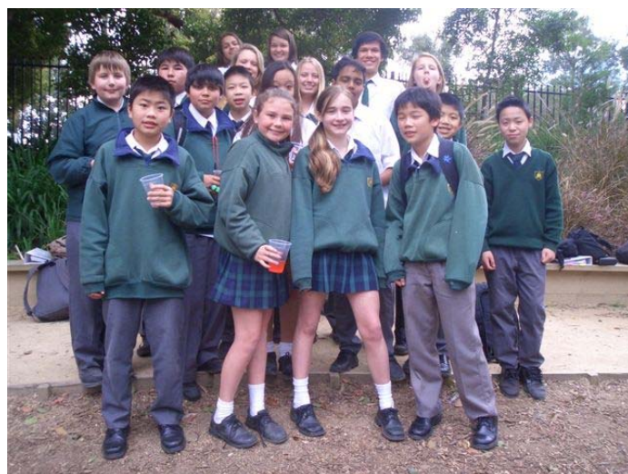
Scenes from the Peer Support Picnic