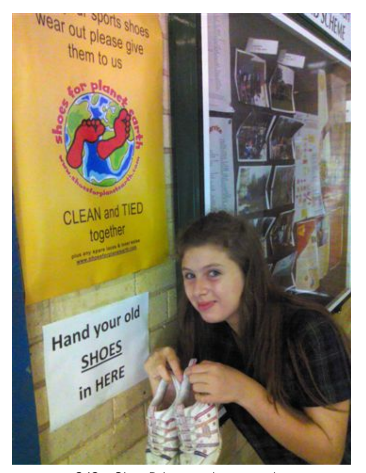
SJC – Shoe Drive ongoing campaign

Afternoon tea provided after the concert. For further details, please phone 0413058749