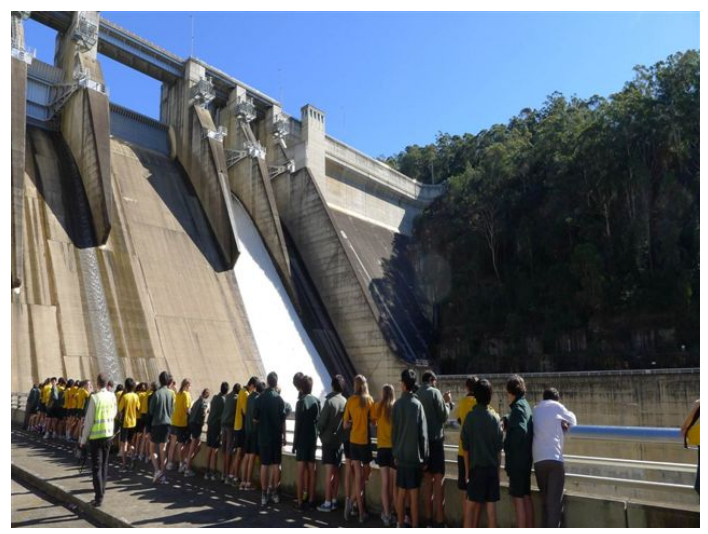
Year 8 students at Warragamba Dam – 4<sup>th</sup> May 2012

For more information on the forum contact KYDS on 9416 9824 or visit www.kyds.org.au