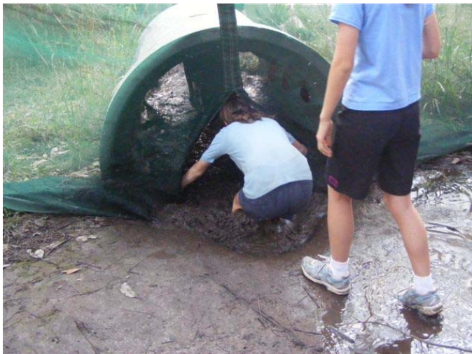
Killara High School