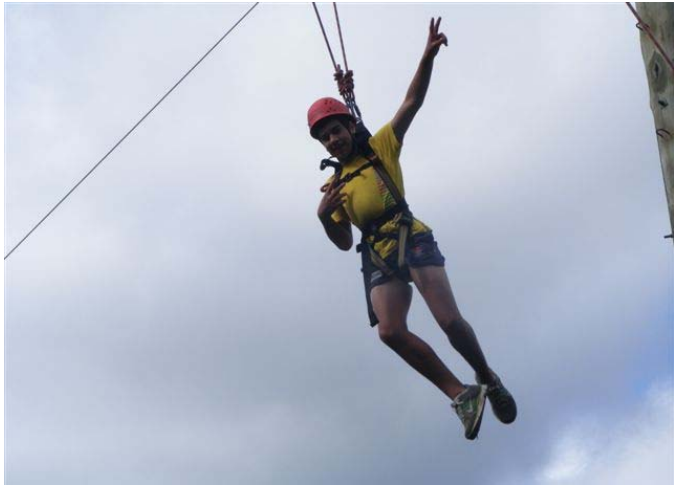
Year 9 Camp – May 2011