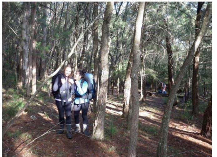
A great school close to home