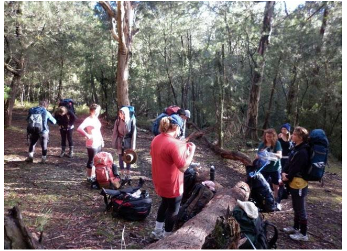
DEAS Gold Practice Expedition – April 2011