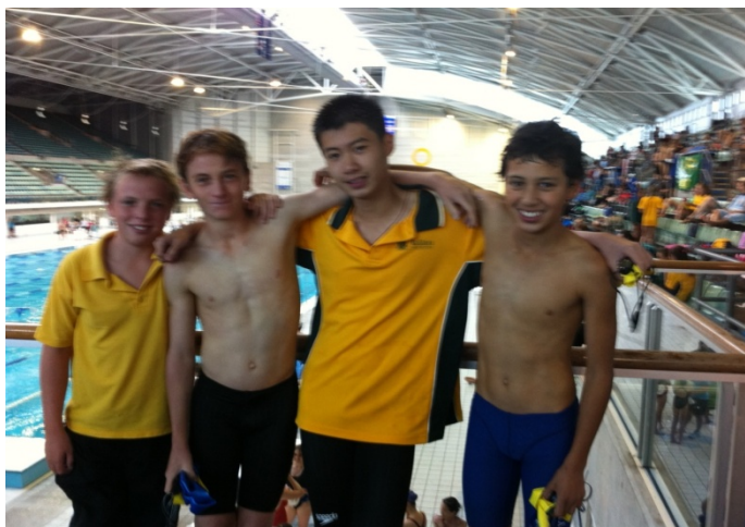
Boys 13yrs 4x50 relay team (finished 1 st and broke the Zone record)

Some of the outstanding individual performances were: