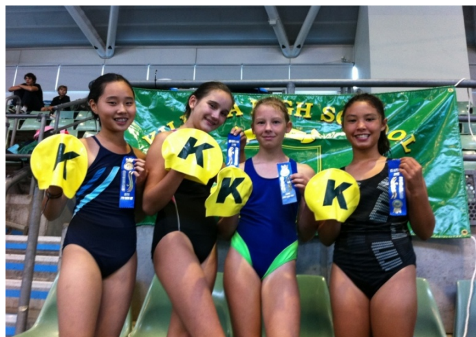
Girls 12yrs 4x50 relay team