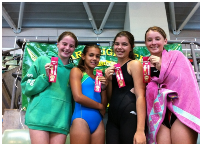
Girls 13yrs 4x50 relay team