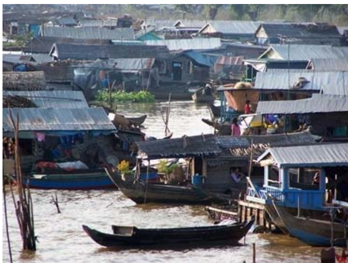
Village life on the Tonle Sap Lake, Cambodia

The tour will also take us to the Cu Chi Tunnels which will give our students a unique experience of underground life in the American/ Vietnam War.