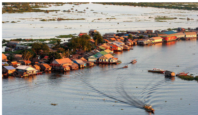
Floating Village on the Tonle Sap Lake, Cambodia

On Friday 2 nd July, 19 very excited Year 11 students accompanied by three teachers will be flying to Ho Chi Minh City in South Vietnam. We will be studying the influence of Buddhism on the lives of the people of Vietnam and Cambodia by visiting ancient pagodas and having discussions with monks. We will be staying one night in a monastery where we hope to gain a deeper understanding of Buddhist monastic life. On the way to the Cambodian border we will visit the home of the unique Cao Dai sect. The religion is a hybrid of Buddhism, Taoism, Confucianism and Christianity.