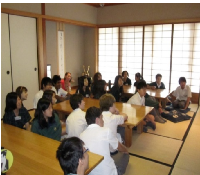
Year 8/9 students in the Tatami room

Japanese students from Years 8 and 9 were involved in an excursion to the Nihon Tanken Centre on the 31 st of March or the 24 th of April respectively.