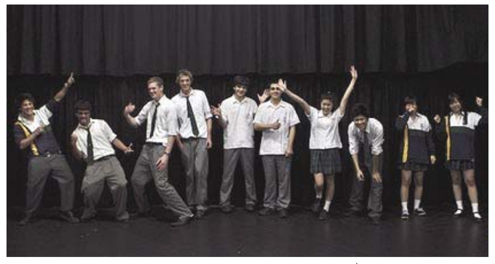
Photo courtesy of The Sydney Morning Herald – Monday 18th October 2010

Her work over the last six years has been a gift of immeasurable value to all of these young people.