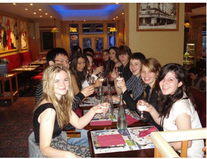
More scenes from the French Study Tour